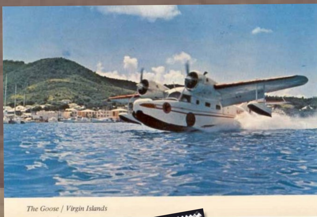
The Goose / Virgin Islands

From February 1964 to September 1981, Antilles Air Boats flew over 380,000 flights and carried over 2.8 million passengers. The Goose at Antilles Air Boats operated with ten passenger seats and at its peak, flew between St. Thomas and St. Croix (one of its many routes) every twenty minutes during daylight hours. This frequency allowed for business and government officials to meet their demanding schedules as well as giving the locals and tourist the important connection between the islands. The sight and sound of the Grumman Goose in the harbor at Charlotte Amalie during those years was truly part of island life.