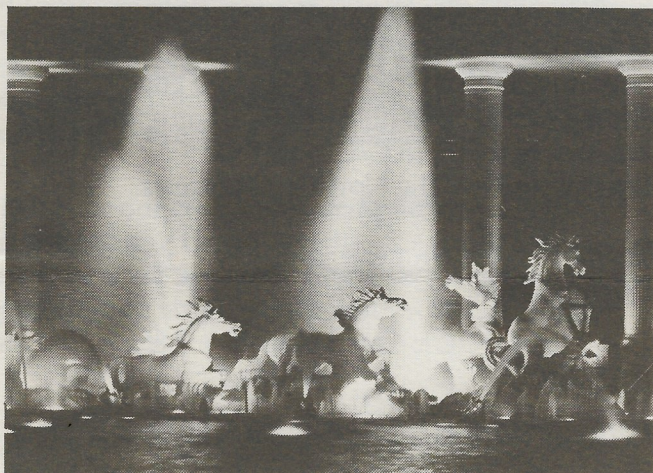
The lighting of the majestic marble stallions brings the Palace Court to life during the Kauai Lagoons blessing ceremony.