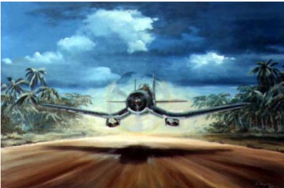
Left: Corsair Low Pass

Society of Illustrators in New York, the Society of Marine Artists and is the past President of the American Society of Aviation Artists. Quote - "Retirement is a very busy part of ones life".