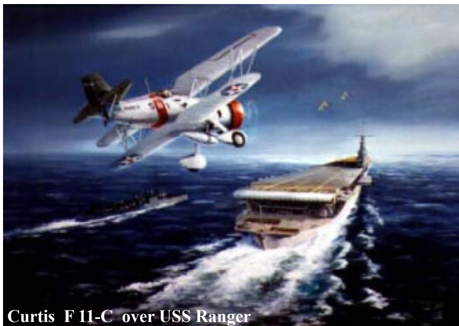
Curtis F 11-C over USS Ranger