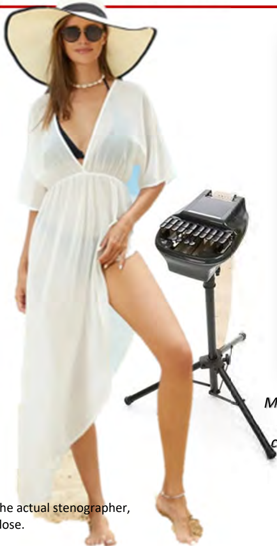
Not the actual stenographer, but close.