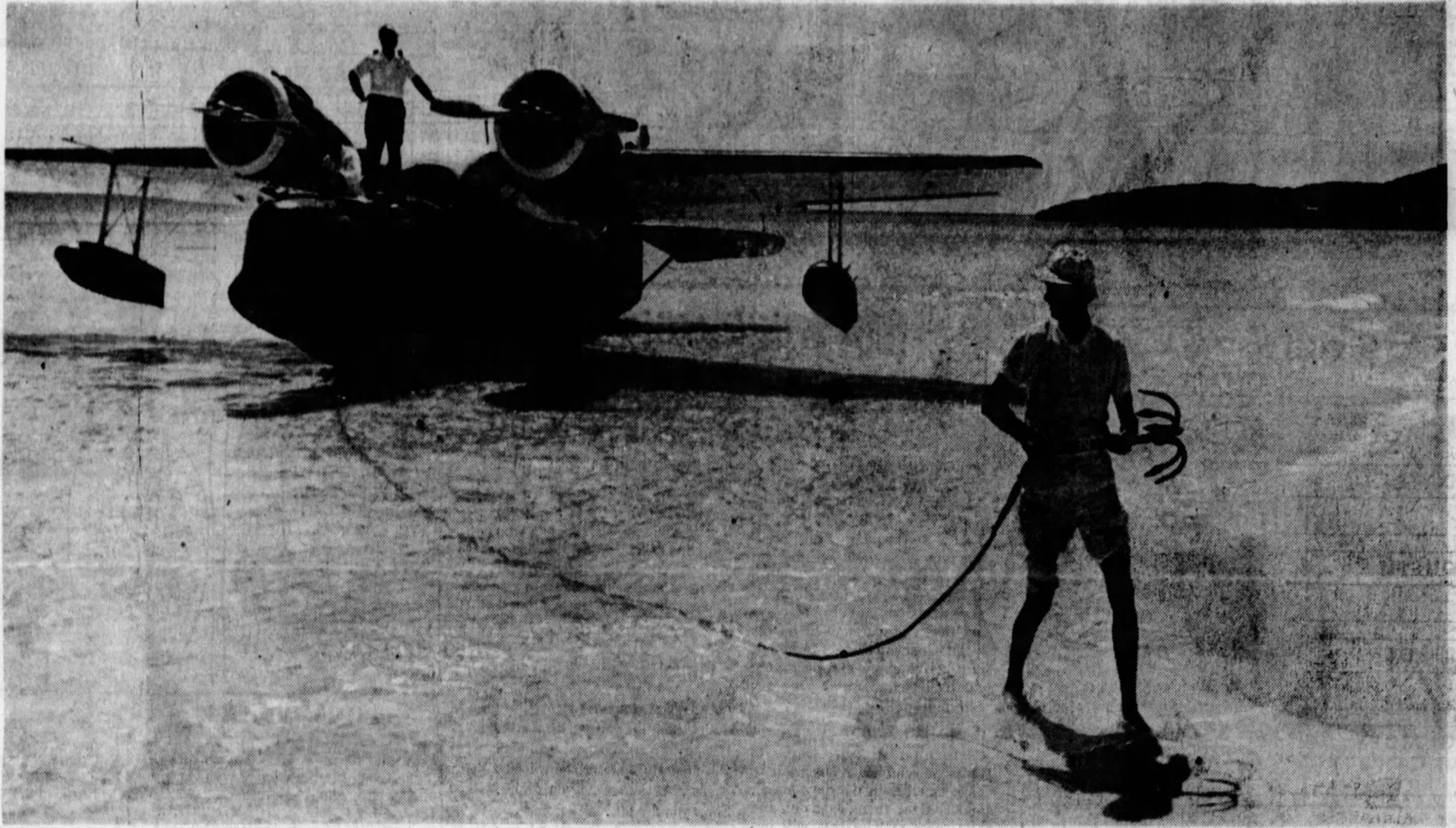
Sosin Carries Anchor Ashore To Prevent Plane From Drifting Away From Anguila Cay

We knew we'd be picked up, but we didn't know how