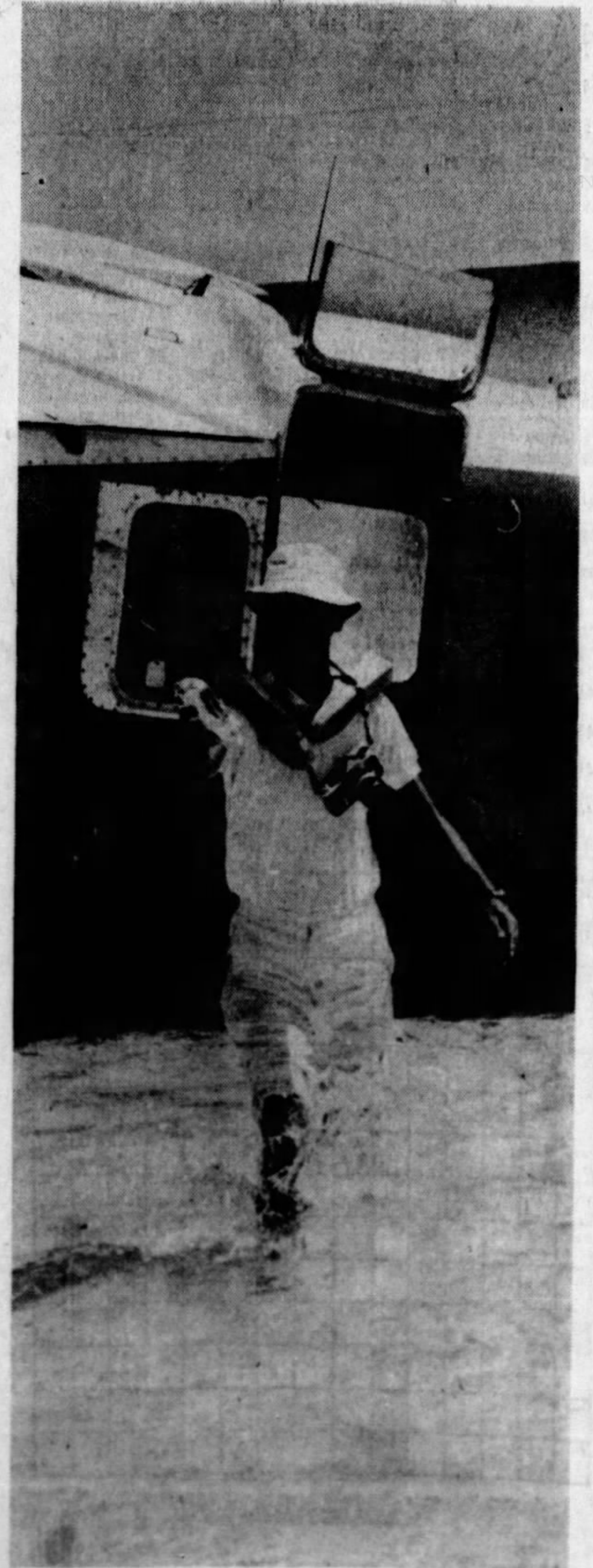
An Easy Wade Ashore From Seaplane