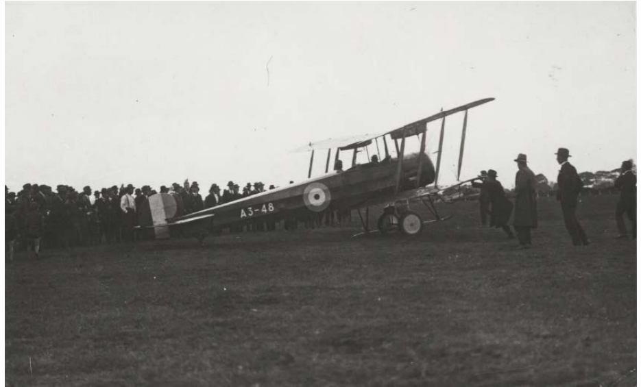
Avro 504K, A3-48 ready for take-off at Mascot on 15 June 1922