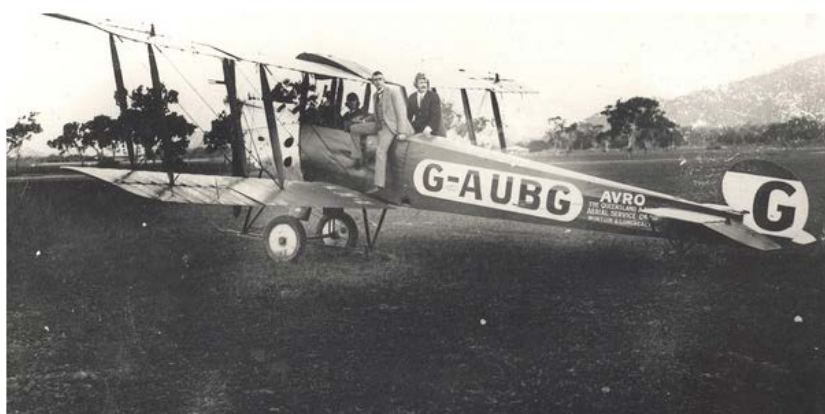
Queensland and Northern Territories Aerial Services, Ltd, first aircraft, an Avro 504K, G-

An initial 20 504Ks were assembled from parts shipped from the UK. AA&EC built six of these with Sunbeam Dyack 100 hp six-cylinder-in-line liquid cooled engines. One of these, G-AUBG, which was delivered on 30 January 1921, was the first passenger aircraft purchased by Queensland and Northern Territories Aerial Services, Ltd (Qantas).