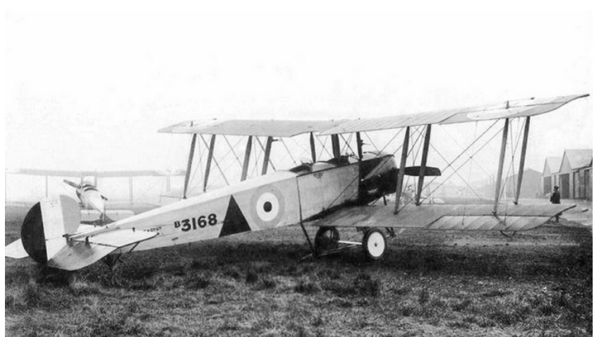
Avro 504J B3168 – Built by AV Roe & Co Ltd.

With the outbreak of WWI, the Avro 504, manufactured by A.V. Roe & Co Ltd and later manufactured under licence by at least 18 contractors, was used as a trainer, fighter and bomber during WWI. It was the most produced aircraft of any kind that served in any military capacity during WWI, with 8,340 produced during the war. Overall, more than 10,000 were built between 1913 and when production ended in 1932. The most significant versions were the Avro 504J (2070 were built) and the Avro 504K (4997 were built).