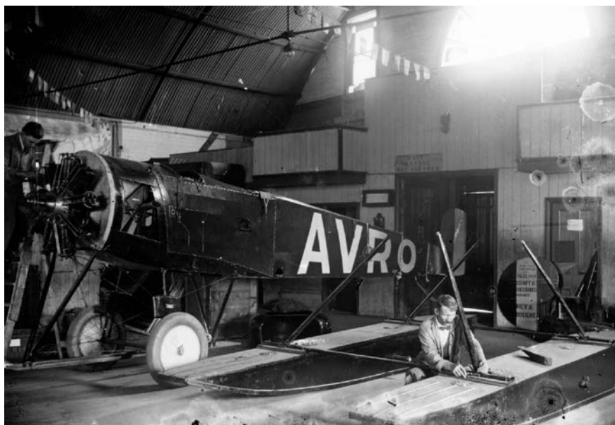
Avro 504K being assembled at the Mascot Australian Aircraft and Engineering Company. Date and origin unknown