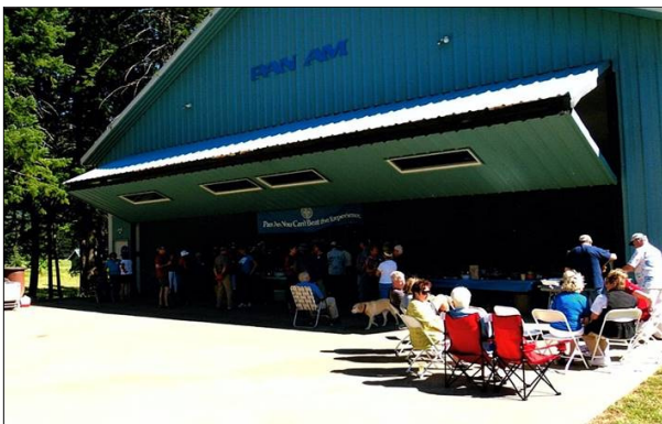
Previous picnic at the Pan Am hangar on the Smith farm in White Salmon, Washington

area on that date, you can contact Betsy at (541) 520-2801. They are located on the Washington side of the beautiful Columbia River Gorge in White Salmon, WA, just across the river from Oregon's Hood River. It is approximately 60 miles east of Portland, OR. The Smiths are providing everything and only ask that you let them know ahead of time if you plan to show up. If you are the camping type and bring your own tent or camper, you are invited to spend the night under the stars on their farm. . . .