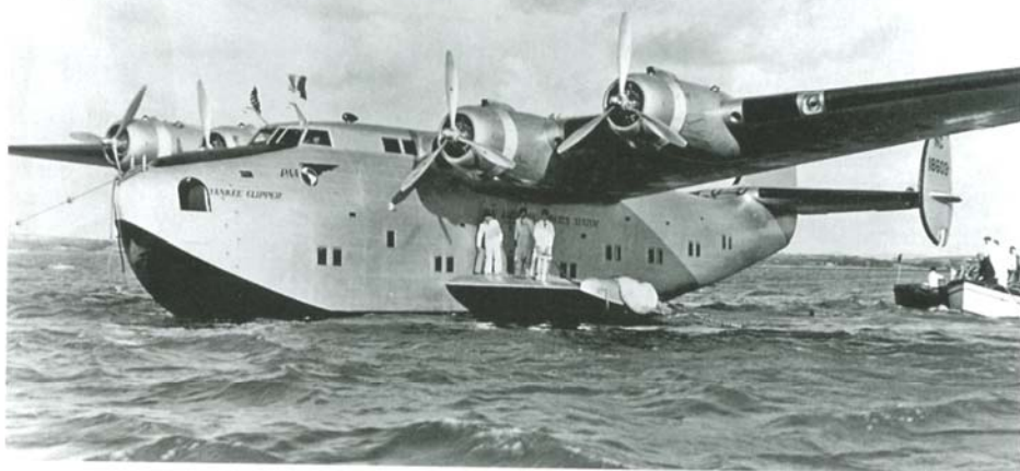
Boeing 314 Yankee Clipper arrived at Foynes on July 9, 1939, on the first Pan American trans-Atlantic passenger service over the northern route between New York and Southampton.