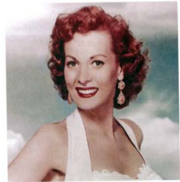
Maureen O'Hara was patron of the museum until her death in October 2015.