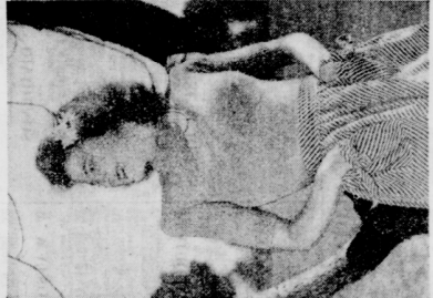
This jumper, knitted in stocking stitch, is light enough for spring.

No woman can ever have too many duplicates of this pattern... In several colours, it is a standby in any wardrobe.