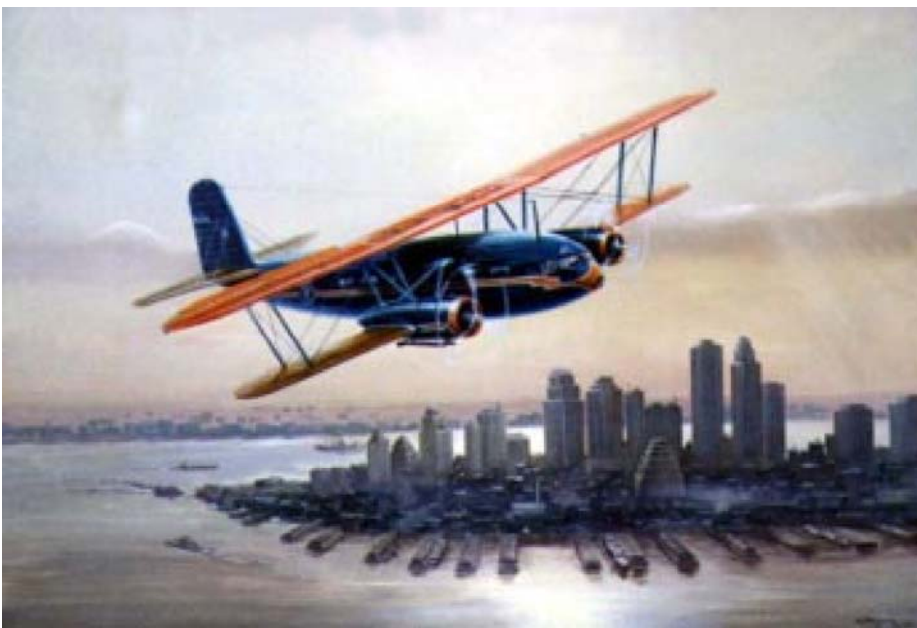
Top Left: Curtis O2-U