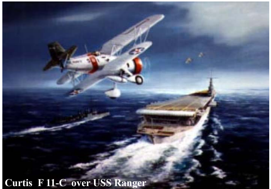
Curtis F 11-C over USS Ranger