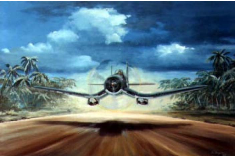
Left: Corsair Low Pass

Society of Illustrators in New York, the Society of Marine Artists and is the past President of the American Society of Aviation Artists. Quote - "Retirement is a very busy part of ones life".