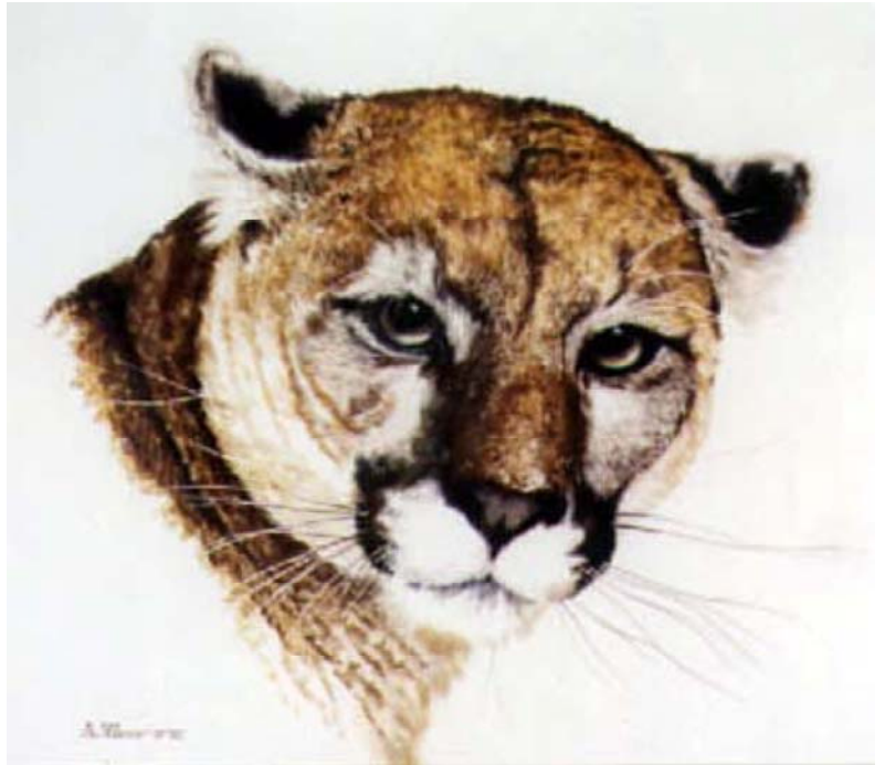
Center Right: Cougar in Bridgeport Zoo