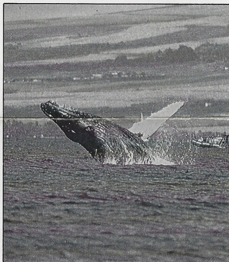
Humpback whales at play in Maui.

All whales are mammals, so they must come out of the water to breathe. It's an awesome sight when one of these huge creatures emerges from the water to breach — leaping almost straight up, exposing nearly half its massive body and splashing down with a thundering crash. The unique way these whales roll their huge bodies out of the water in high arcs to display their curved backs is another reason they were named humpbacks.